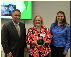
Jefferson County Commission Landuse Development