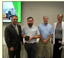
Guyandotte River Trail Environmental Partnership