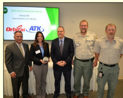
Orbital ATK Improvement to Air Quality