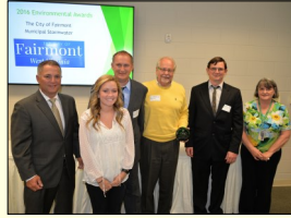
The city of Fairmont Municipal Stormwater