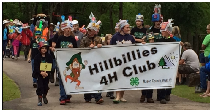
Despite pesky rain clouds, the recycled hat parade went on as scheduled. Here, members of the Hillbillies 4H Club of Mason County show off their creations.

The answers to the scavenger hunt were found in the numerous exhibits on display from various environmental agencies such as the Division of Natural Resources, the Division of Forestry and the DEP's own Division of Air