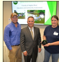
Friends of Hughes River Education and Community Involvement