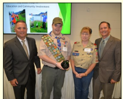
Boy Scout Troop 99 Education and Community Involvement