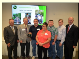
Buffalo Creek Watershed Assoc. Cabinet Secretary Award