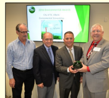
The city of St. Albans Environmental Stewardship