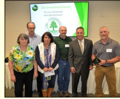
The city of Charleston Municipal Stormwater