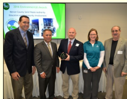
Mercer County SWA Education and Community Involvement