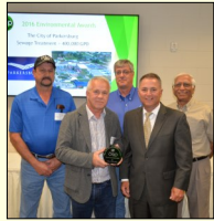
The city of Parkersburg Sewage Treatment > 400,000 GPD