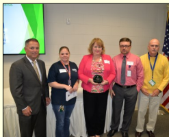
Highland Hospital Water Conservation